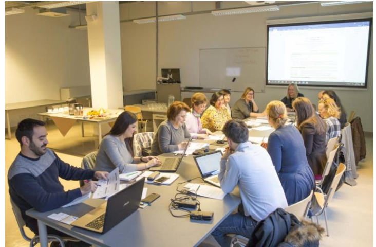
Institute of Design Technologies at Riga Technical University

The second Technical Meeting was held in Brussels on 23th of May at the premises of ECORES , project partner and expert in circular economy and new business models.