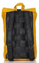
Airpaq Unicolor Yellow